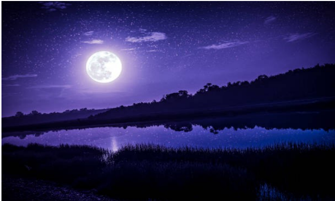
CLAIR DE LUNE