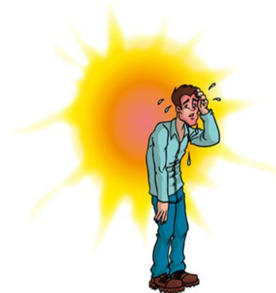
CHAUD / CHAUDE