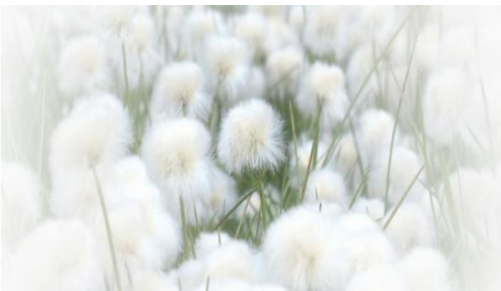
DOUX / DOUCE